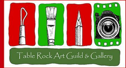
Table Rock Art Gallery