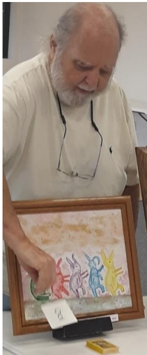
Uncle Wiggily's Jack O'Keefe