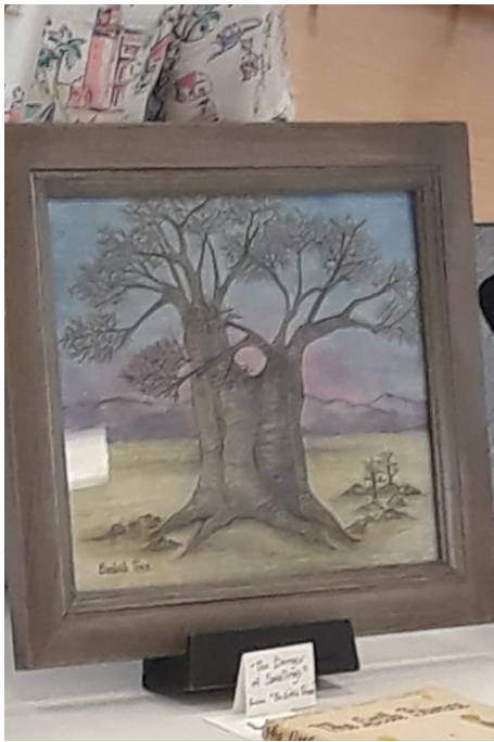
The Little Prince = Gayle Page