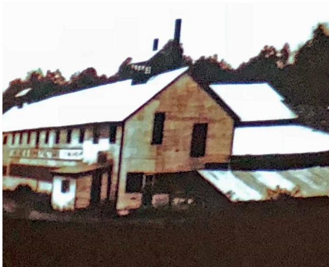
Tomato Cannery, Reed Springs