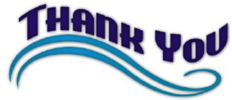
Table Rock Art Guild Meeting Minutes January 15, 2017

The meeting was cancelled due to weather.